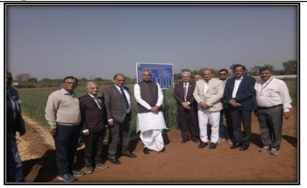
Hon Governor Shri Acharya Devvrtaji visited the Bio Intensive Nutrient Management Experiment.