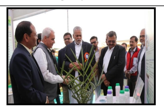
Central Union Minister of The state Government of India - Agriculture, Farmers welfare & Panchayati Raj Shri Parshottam Rupala visited on 17/01/2018.